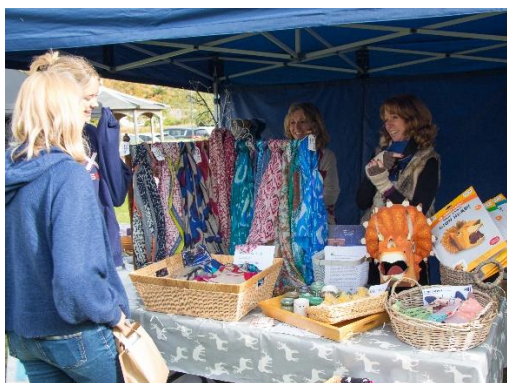
Early Christmas Market Oct '20