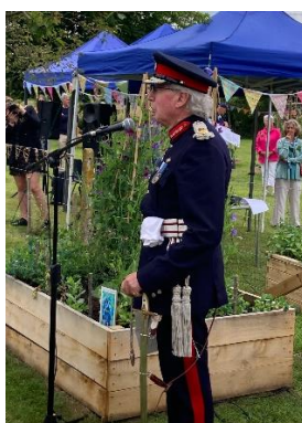
Grand Opening of the Fontmell Friendship Garden June '21